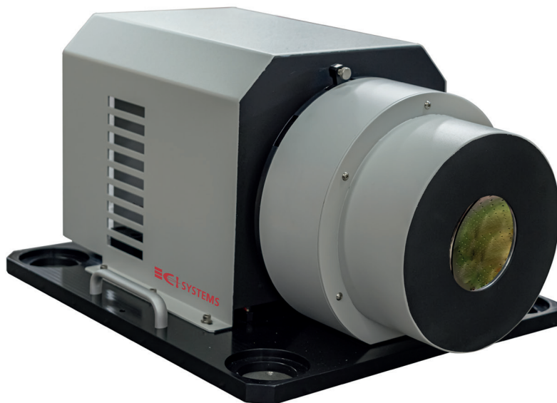
WFOV Distortion Mapping Tester for LWIR

(1) Distance from UUT entrance pupil to Collimator's front aperture